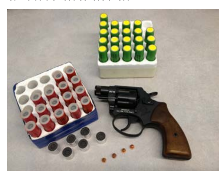
Portable equipment pyrotechnic with assortment of flares, Vancouver International Airport

Portable equipment, that requires a staff member on the airfield to operate it, is generally regarded as offering the best control, providing that the staff members involved are properly trained and motivated. Devices such as pyrotechnic, pistols, or vehicle mounted distress call generators produce an impression of a direct threat which can be continually varied in time and location by the operator in a manner not available to static systems. This is to prevent wildlife habituating to a static device as they learn that it is not a serious threat.