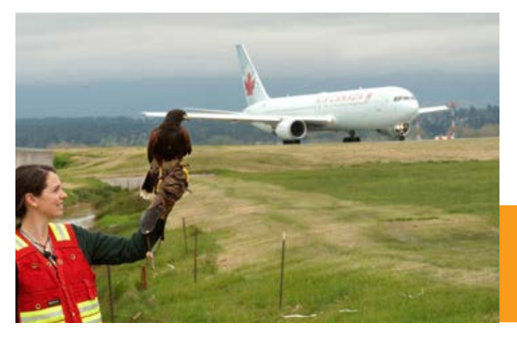
It is also important to remember that falcons and dogs are not effective at dispersing all hazardous birds in all conditions. They should be regarded as one tool amongst many that the bird controller can use. The use of trained predators alone is not an adequate substitute for the other bird management techniques described above. These can be particularly effective with large flocks of birds on the ground around an airport – however the deployment of such methods needs close coordination with ATC so as to not create a hazard by lifting the birds when aircraft are landing or taking off.

Trained falcons and dogs, which are both potential predators for many species of hazardous birds found at airports, are undoubtedly effective in dispersing birds. To work properly, however, considerable investment in the training of both the animals and their handlers needs to be made. This training is essential to both in orde to ensure that the animals do not become a strike risk and also to ensure that the deterrent value of deploying the falcon or dog is maximised. Airports should not underestimate the staff time and cost involved in incorporating falcons or dogs in their bird control programmes.